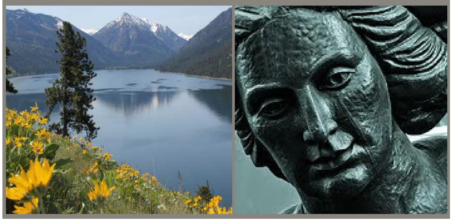
Wallowa Lake in eastern Oregon