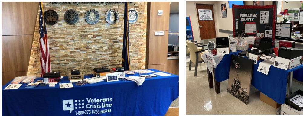
Firearm Safety Week tables at Lafayette Main CBOC and Natchitoches CBOC that display and demonstrate a variety of firearm storage devices.

flyers with 10% Veteran retail discounts on firearm storage or locking devices, and other free suicide prevention materials such as magnets, pens, and bandanas imprinted with Veterans Crisis Line information.